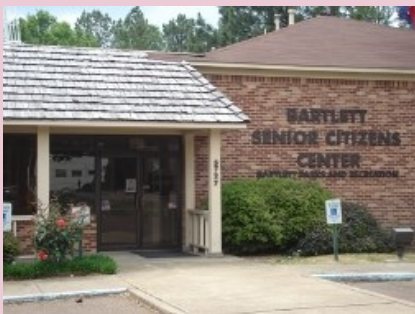
Bartlett Senior Center